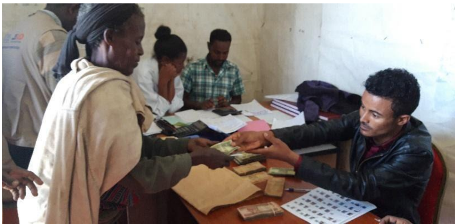
A joint emergency operation in South Gondar woreda, Ethiopia, in collaboration with CCD partners (CARE, Save the Children, World Vision and other agencies).

CCD Network COVID 19 Response Strategy: March 2020-Dec 2021